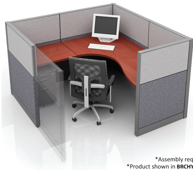
*Assembly required. *Product shown in BRCHY Color